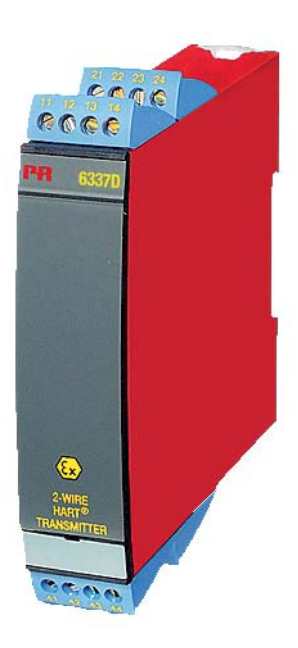
Figure 1: Temperature transmitter PR5337 and PR6337

The temperature transmitter PR5337 / PR6337 with 4..20 mA output is an isolated two-wire 4..20mA device used in many different industries for both control and safety applications. Combined with a temperature sensing device, the temperature transmitter PR5337 / PR6337 with 4..20 mA output becomes a temperature sensor assembly.